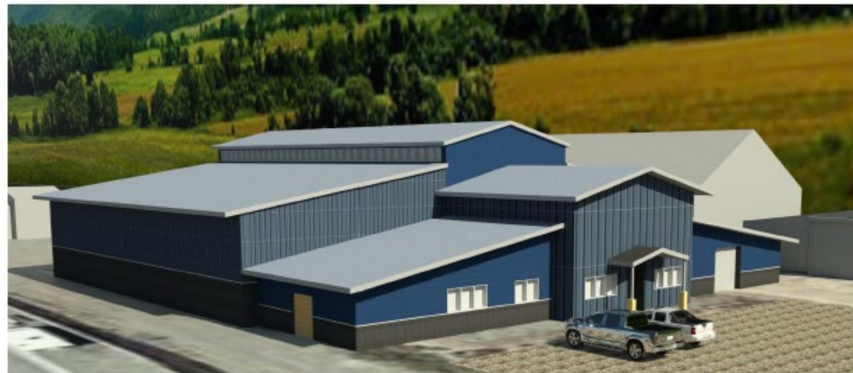
Render Blue Scheme SE