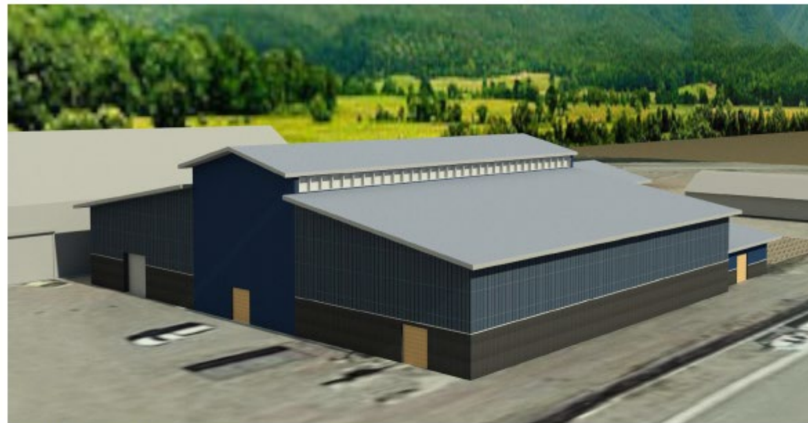
Render Blue Scheme SW